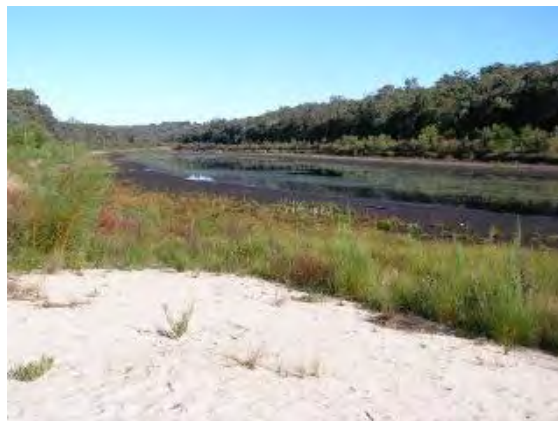
Figure 1. Lake Werri Berri – water levels critically low in June 2010 ; the lake dried completely that year

Levels were particularly low in 2010 (Figure 1) and then rose quite slowly – below many people’s expectations (Figure 2). However, the lakes at the time of writing are now as full as they’ve been in recent decades (Figure 3).