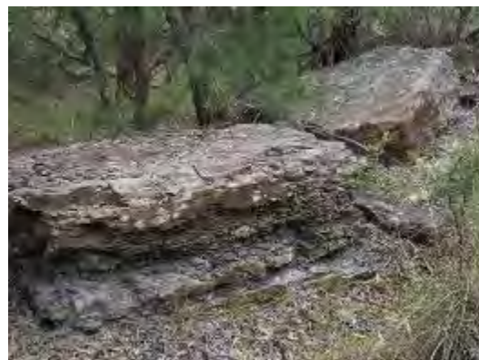
Minchinbury Sandstone, Lansdowne Park (Mirrumbeena Regional Park)