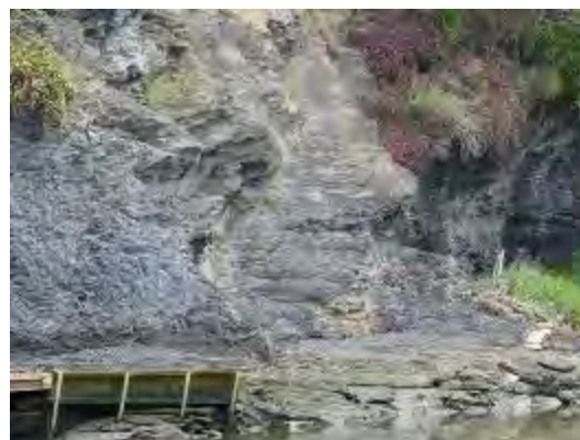
Ashfield Shale cliff at Parramatta ferry wharf

The Geology and Resource Potential of the Wianamatta Group, Geological Survey of NSW Bulletin 25