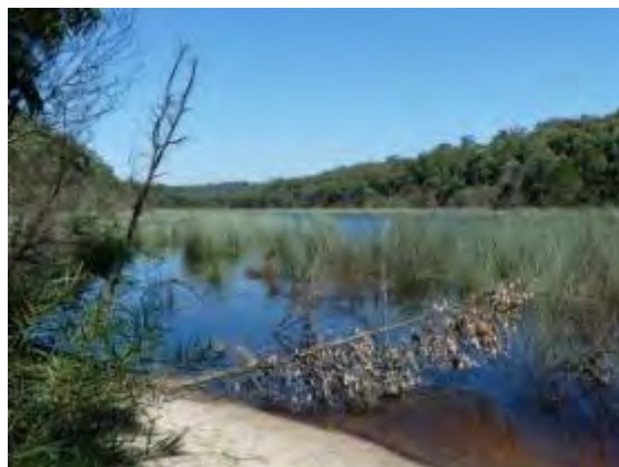
Figure 3. Lake Werri Berri in March 2017 with prolific growth of Grey Rush Lepironia articulata but with many young shoreline trees dead or dying from waterlogged roots

You can easily access the rainfall data of the Bureau of Meteorology’s automatic rain gauge located near Buxton 3 km to the south, via http://www.bom.gov.au/climate/data/index.shtml and from it you can deduce some interesting correlations.