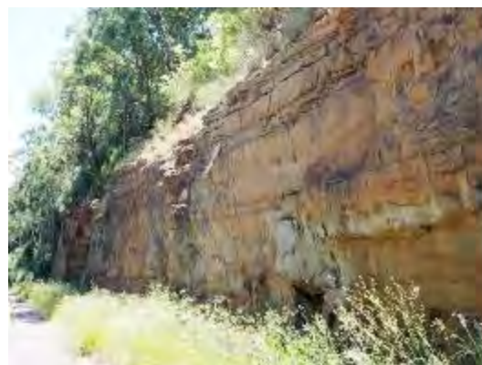
Razorback Sandstone Member of the Bringelly Shale; Razorback Mountain on the old Hume Highway near Picton