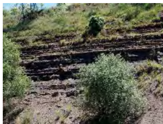
Bringelly Shale laminites and siltstones along the old Hume Highway near Picton