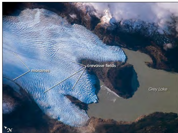
June 4, 2007

As you can see the Grey Glacier has receded significantly over the past 28 years as has happened to most glaciers in South America, a sign of rising temperatures and changing rainfall patterns – more rain and less snow.