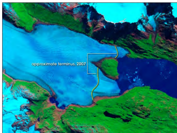
January 14, 1986