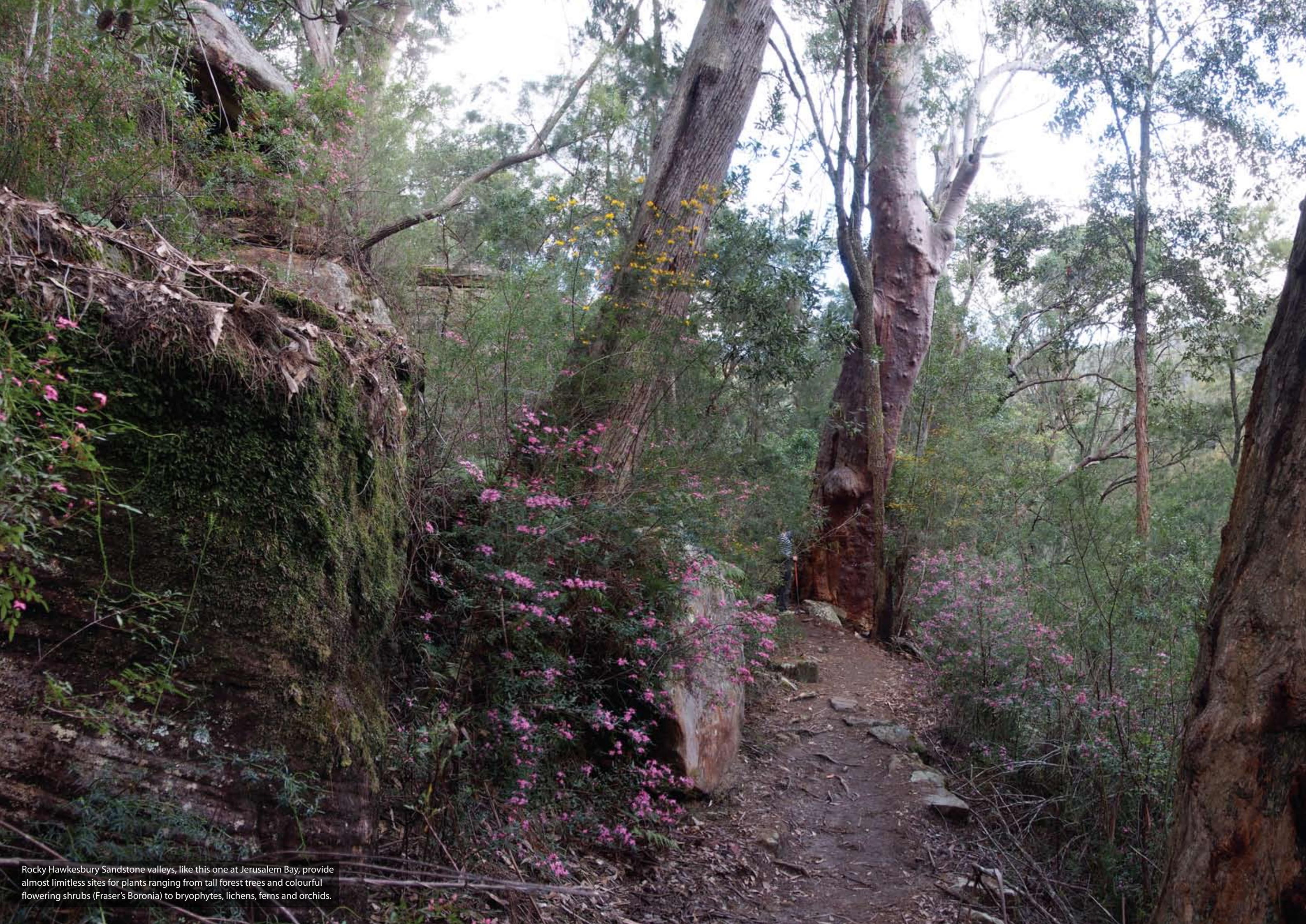
Rocky Hawkesbury Sandstone valleys, like this one at Jerusalem Bay, provide almost limitless sites for plants ranging from tall forest trees and colourful flowering shrubs (Fraser's Boronia) to bryophytes, lichens, ferns and orchids.